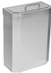
PPA4010CS Satin Finish