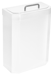
PPA4010 White epoxy finish