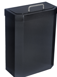
PPA4010B White epoxy black